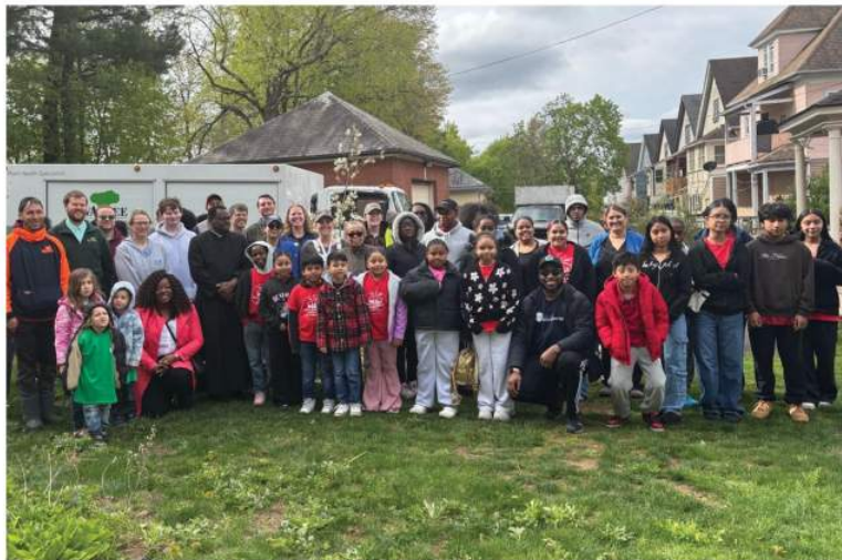
In April, hardworking volunteers of St. Justin-St. Michael Parish helped add new greenery to the church and rectory grounds. They pause for a photo after doing their work.