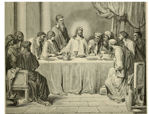
The Bible Panorama, by William A Foster, c. 1891

Watch The Mass Explained series on YouTube here →