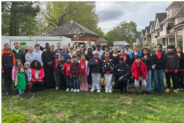
In April, hardworking volunteers of St. Justin-St. Michael Parish helped add new greenery to the church and rectory grounds. They pause for a photo after doing their work.