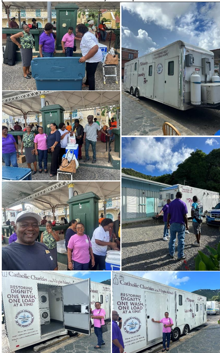
Catholic Charities: community of compassion for the homeless

Air Conditioning Fund as of November 16, 2025: