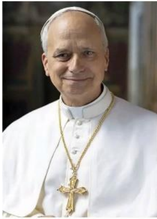
Leo P.P. XIV Pope Leo XIV