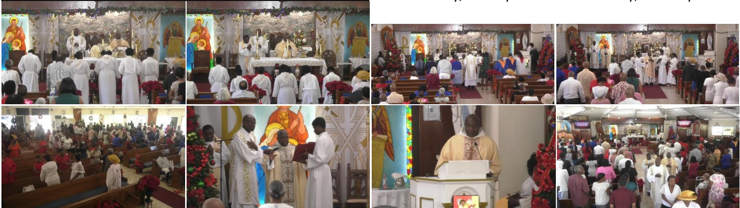
Patronal Feast Mass, December 28, 2025

Air Conditioning Fund as of January 4, 2026: $215,495.25