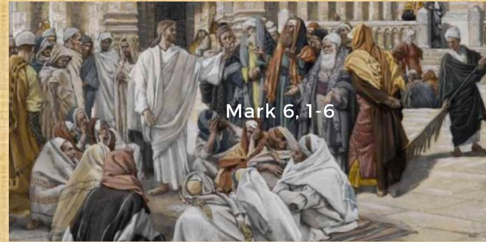
Mark 6, 1-6

1st Reading: Ez 2:2-5 2nd Reading: 2 Cor 12:7-10 Gospel: Mk 6:1-6