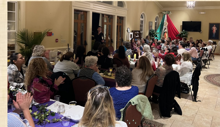
Advent By Candlelight 2022