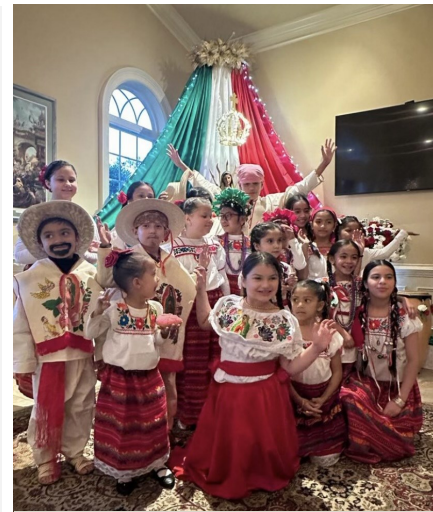
Our Lady of Guadalupe Celebration