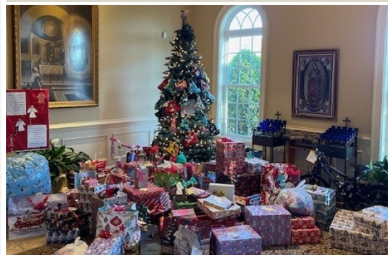
ST. VINCENT DE PAUL SOCIETY—distributed gifts to 41 children and 7 senior citizens.