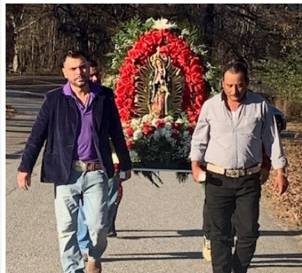
Our Lady of Guadalupe Celebration