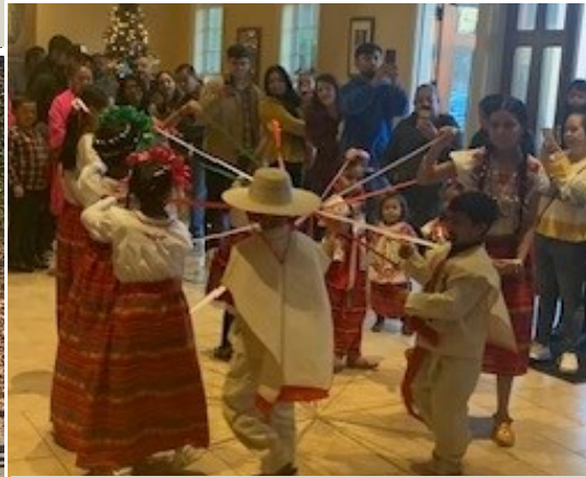
Our Lady of Guadalupe Celebration