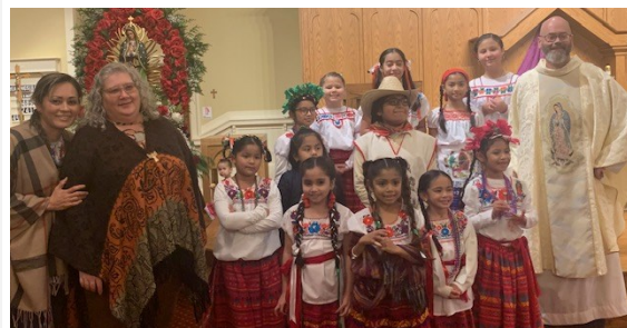
Our Lady of Guadalupe Celebration