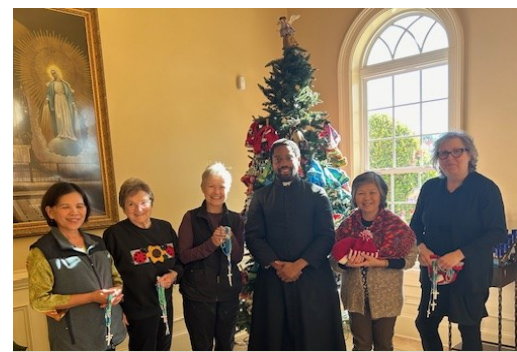
Busy Hands Committee: Hats, Blankets and Rosaries distributed around the globe.