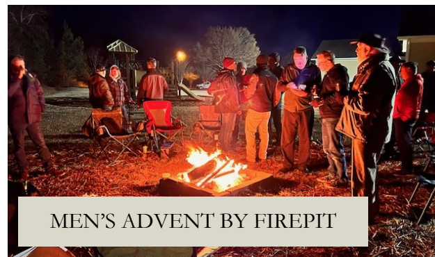
MEN'S ADVENT BY FIREPIT

Viaje del Grupo de la Divina Misericordia al Santuario del Santísimo Sacramento