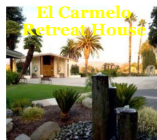
El Carmelo Retreat House

BY ENTERING ANY OF THE FILMED, VIDEOED, OR PHOTOGRAPHED SPACES, YOU CONSENT TO YOUR VOICE, AND/OR LIKENESS, AND/OR THAT OF YOUR MINOR CHILD(REN), BEING USED, WITHOUT COMPENSATION, IN ANY AND ALL MEDIA, WHETHER NOW KNOWN OR HEREAFTER DEvised, AND YOU RELEASE SAINT GREGORY THE GREAT PARISH, SAINT GREGORY THE GREAT SCHOOL, THE DIOCESE OF SAN DIEGO, AND THEIR RESPECTIVE CLERGY, EMPLOYEES, AGENTS, AND VOLUNTEERS FROM ANY LIABILITY RELATED TO SUCH FILMING, PHOTOGRAPHY, OR LIVESTREAMING.