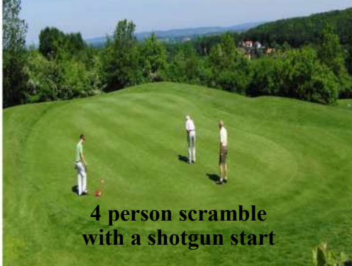
4 person scramble with a shotgun start

Where: The Vineyard at Escondido 925 San Pasqual Rd Escondido, CA 92025