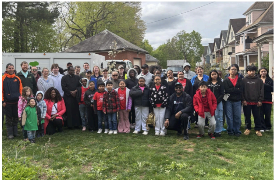
In April, hardworking volunteers of St. Justin-St. Michael Parish helped add new greenery to the church and rectory grounds. They pause for a photo after doing their work.