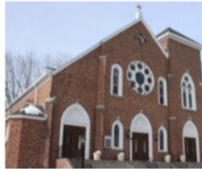
35 Washington Ave

Vigil Mass Saturday 4:30 pm Sunday Mass 11:00 am Weekdays (M,T,W,Th,) 9:00 am Sat. Confession 3:30 - 4:00 pm