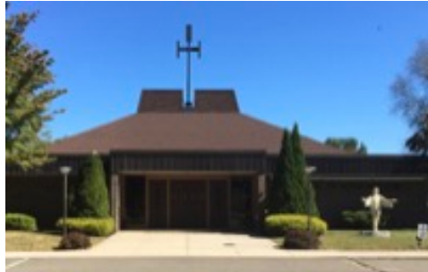
Church of the Good Shepherd 135 Mountain Road