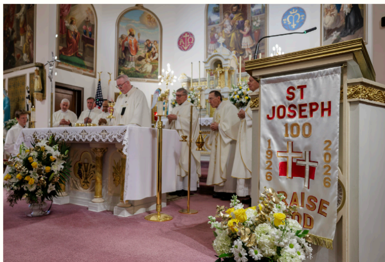
A special flag, Praise God, was designed for the anniversary.